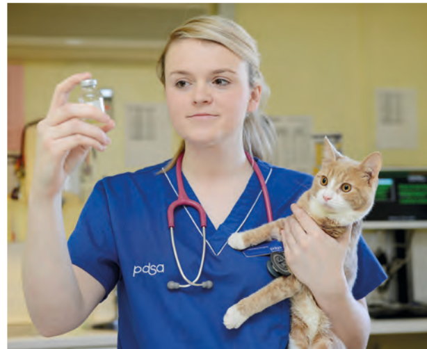
To prevent the spread of disease, PDSA veterinary teams vaccinated 69,000 dogs, cats and rabbits

Our clients also benefited from several campaigns to create awareness of preventive procedures and improve pet health and welfare, such as PDSA Vaccination Month and Rabbit Awareness Month, when special promotional offers were available.