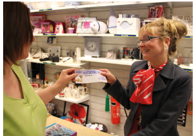
A new initiative to sell raffle tickets in our retail stores helped to boost income

Meanwhile PDSA employees, volunteers and supporters joined in a wide range of exciting fundraising events and challenges from skydiving to diving with sharks, which raised more than £175,000, while six new community-based fundraising groups brought the total number of groups to 41. The community groups raised £35,000. We were also supported by almost 68,000 Best Friends who kindly make regular monthly donations and whose support is so valuable to our PetAid hospitals.